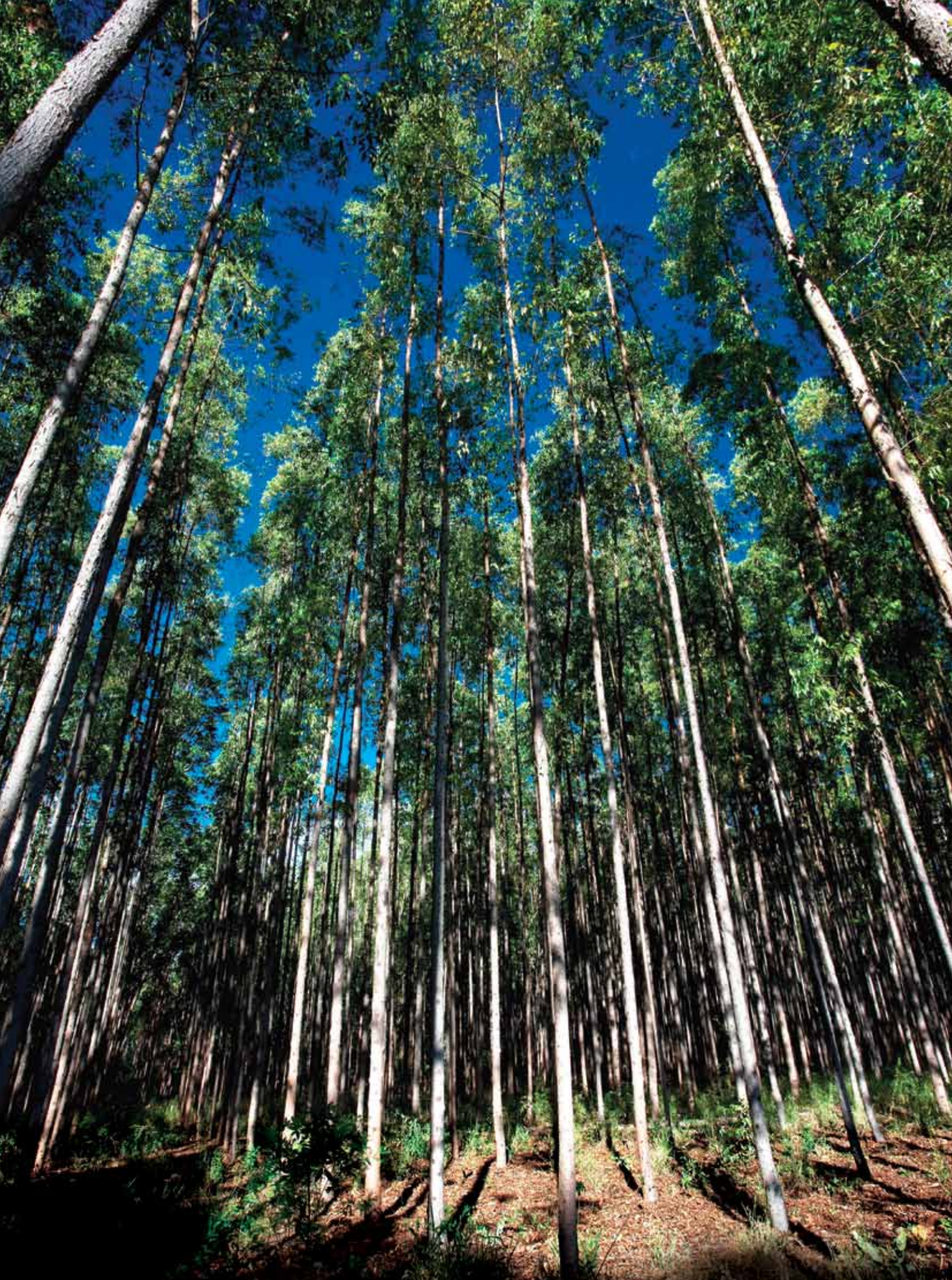
Aperam Bioenergia runs an eucalyptus forestry asset in Vale do Jequitinhonha, state of Minas Gerais, and produces renewable energy within the principles of sustainability, having as goal to meet demands for charcoal from Aperam South America in the town of Timóteo.